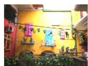
Village Market Shopping Centre