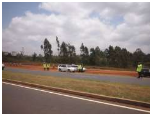
Kitu kidogo cops