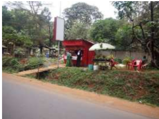
Roadside tea shop