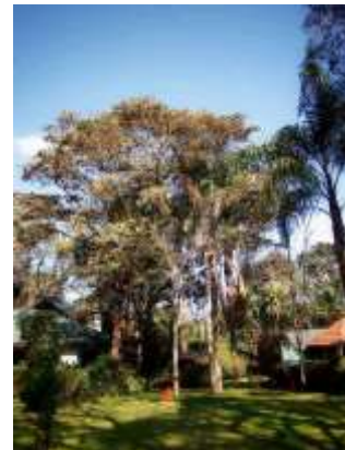
Karen Blixen Coffee Gardens

I could very easily get used to this. I don't know whether it's the climate, the people or the landscape or the combination of all three. There is something in the air, a magical je ne sais quoi that wraps itself around you and just makes you feel good in Kenya.