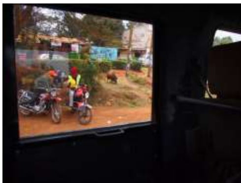
Boda boda motorbike taxis