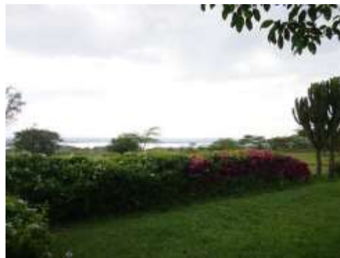
Lake Elementeita from Jacaranda Lodge

A UNESCO World Heritage Site enjoyed by more than 400 species of birds, Elementeita is a paradise for birds and twitchers.