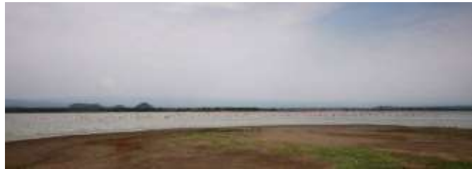
The small pink dots are flamingos.

After lunch we drive down to the shores of the lake, which is resplendent with a cloud of flamingos putting on a great display as they high step through the water in perfect synchronisation, before taking flight. From 50 meters away, through the little lens they are just a pink smudge.