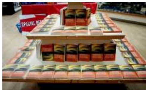
The Textbook Centre, Sarit Centre, Nairobi