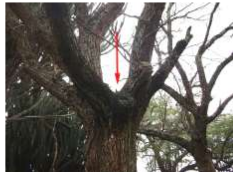
The hidden owl