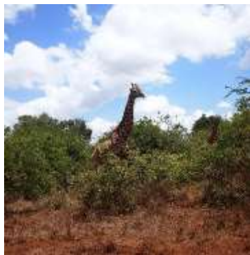
Look – giraffe!

I remark to Kamara that we haven't managed to see any giraffe except through the binoculars. They were once so common, and are now threatened with extinction. People actually kill these majestic, harmless, peaceful creatures for fun. Kamara gazes around for a moment, and then drives towards some woods. Turning onto a track we come across a pair of giraffe standing just a few metres away, looking down on us with their slightly imperious expression. At last I can capture something recognisable!