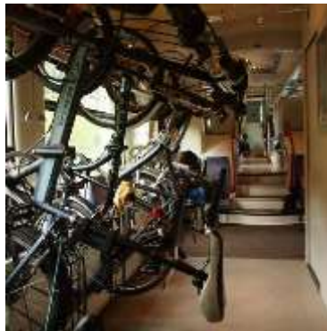
The Hanging Bicycles of SNCF

It’s only a five minute ride to the majestic station of Tours, where I find my final train. Instead of man-handling the suitcase and shoulder bag down the narrow aisle I decide to sit on a little fold-down seat near the door, and settle down once again. Two minutes later a man climbs on with a bicycle and points to a contraption above my head where he wants to hang the bike. I move along to the next little seat, and more men with bikes arrive and they need all the available hooks for their bikes.