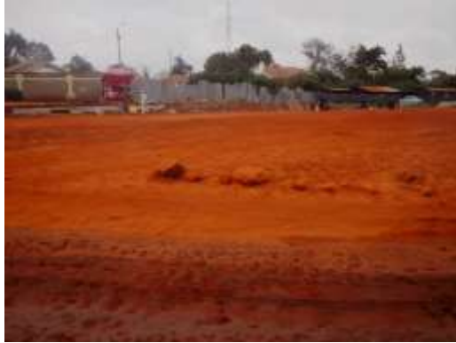
The soil really is that red